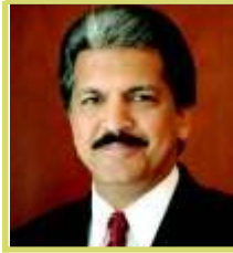
Mr. Anand Mahindra 2012