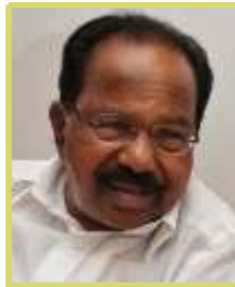
Dr. Veerappa Moily