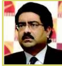
Mr. Kumar Mangalam Birla 2011